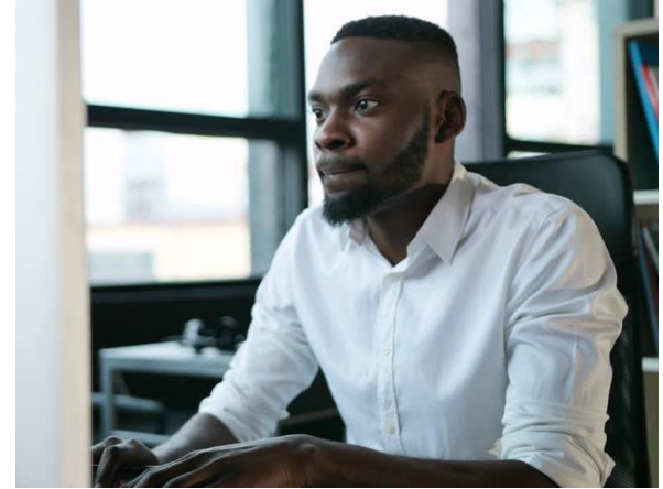
Information Security Analysts