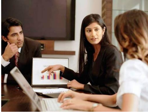
Market Research Analyst

all require education beyond high school